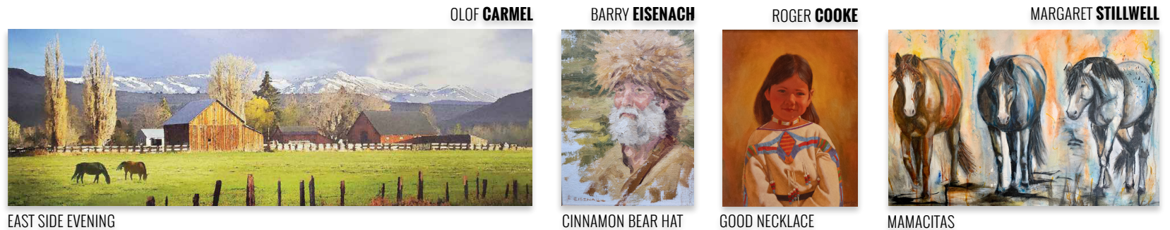
EAST SIDE EVENING