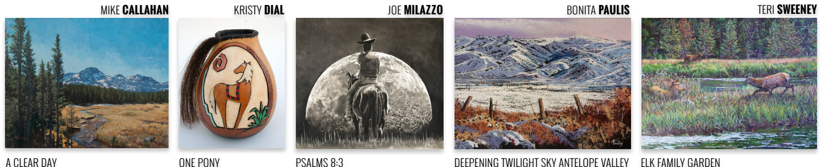
A CLEAR DAY